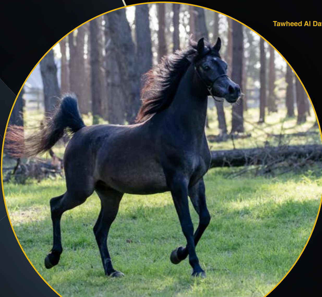
Tawheed Al Dawla

We have decided on a program that mixes RHR Heir of Marwan with these specific Spanish and Egyptian lines as this mix not only bred the best show horses for us but also their relatives have been observed to breed the best amongst international programs in USA, Europe and the Middle East through other Marwan Al Shaqab sons and daughters and Padron Psyche sire lines. Some of the mares sent over were in foal to either RHR Heir of Marwan or Fairview Touch of Magic, so we look forward to seeing their foals in due course'.