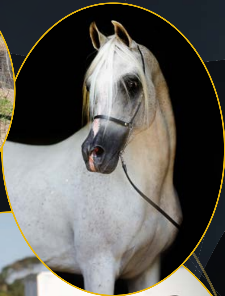
Fairview Touch of Magic