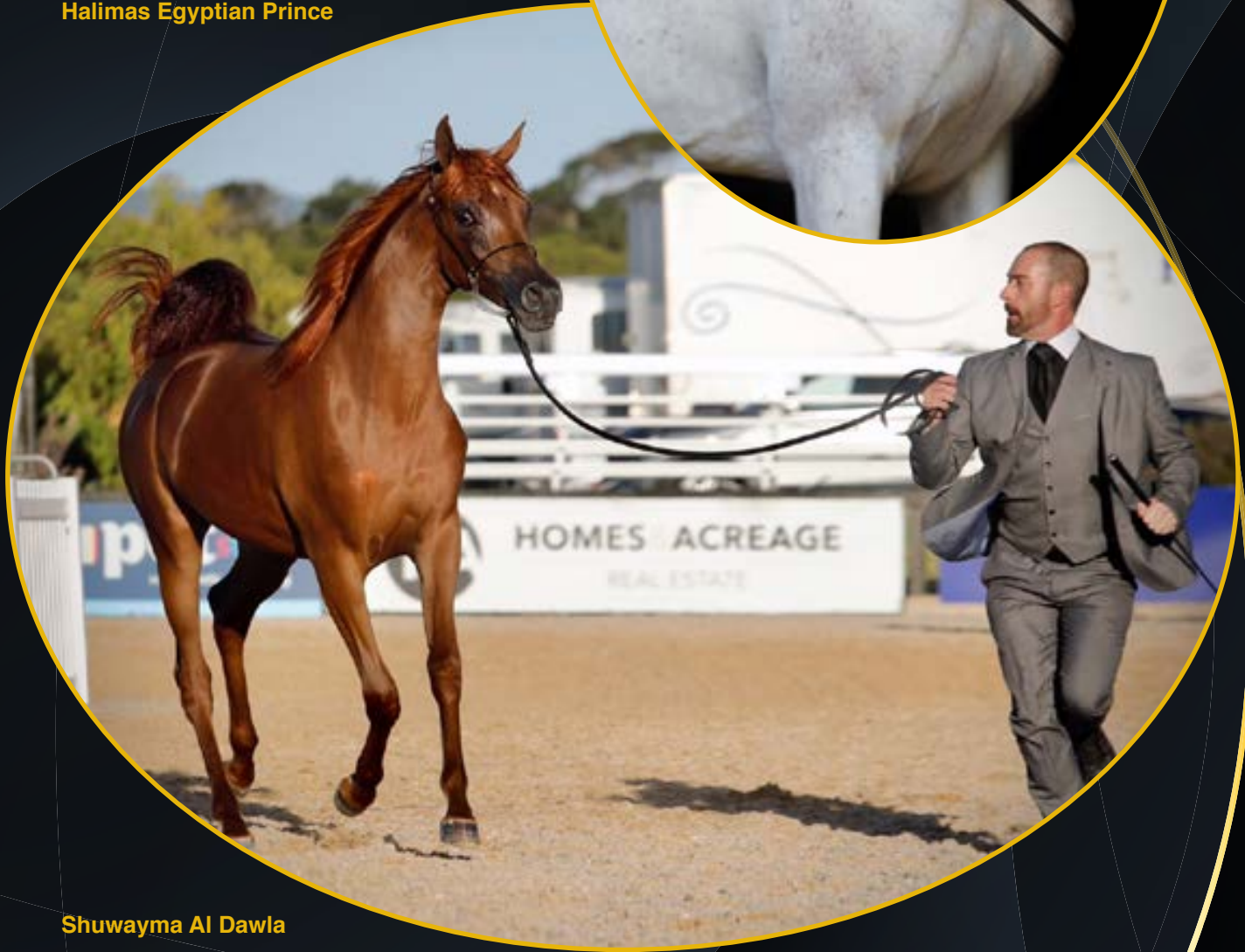
Shuwayma Al Dawla