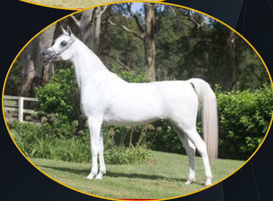
D'amors Jewel in the crown