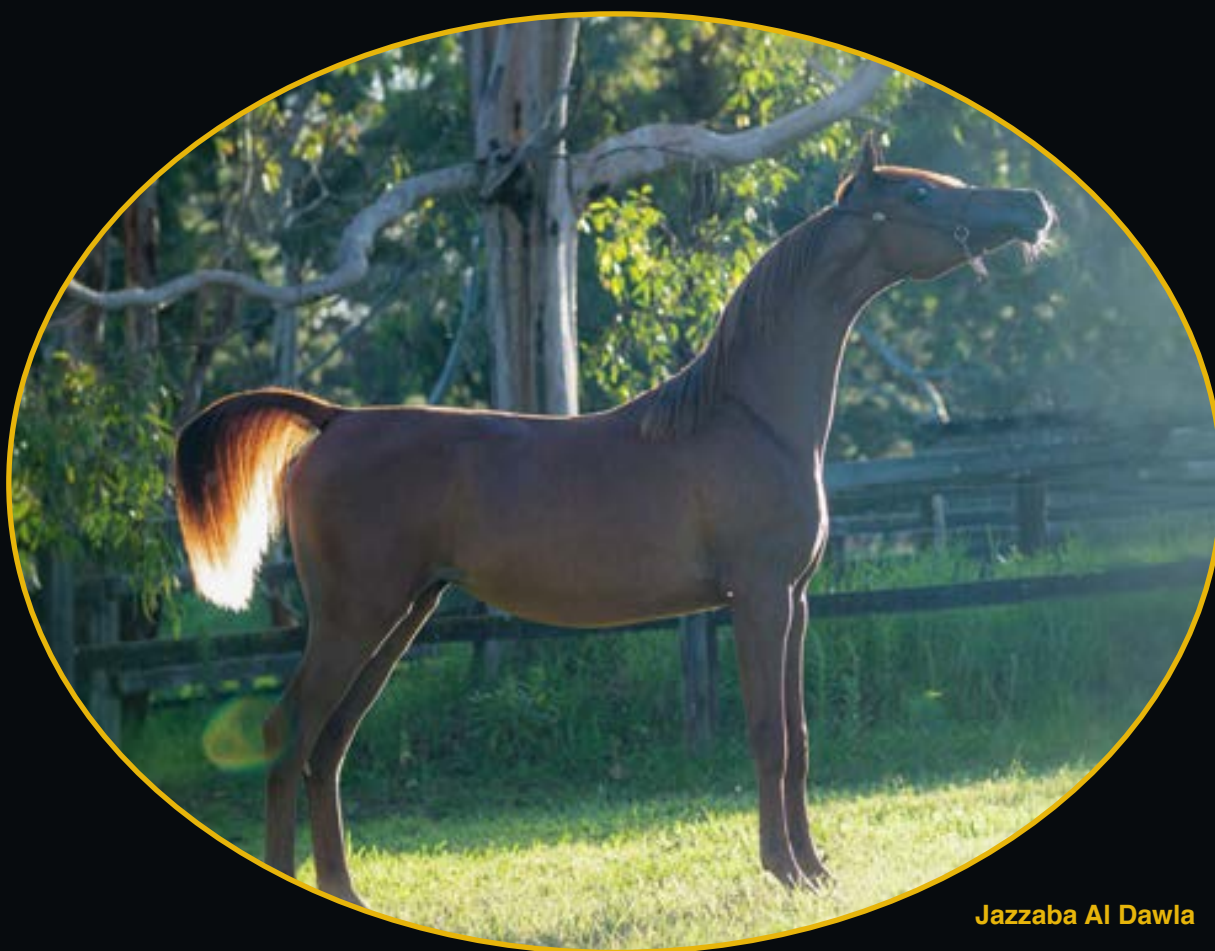
Jazzaba Al Dawla

different new, emerging Arabian Stud farms across the country, where they are taking care of daily breeding, foaling and training. After the major relocation of many to Lebanon and Europe what is left is a small group of treasured older mares who we believe to represent the cream lines of the Australian breeding project within the last 100 years.